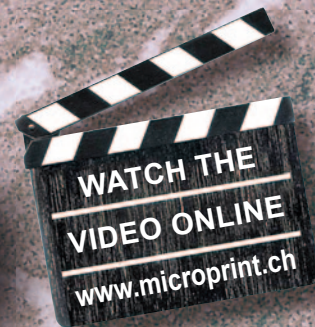
Viscomatic ink control